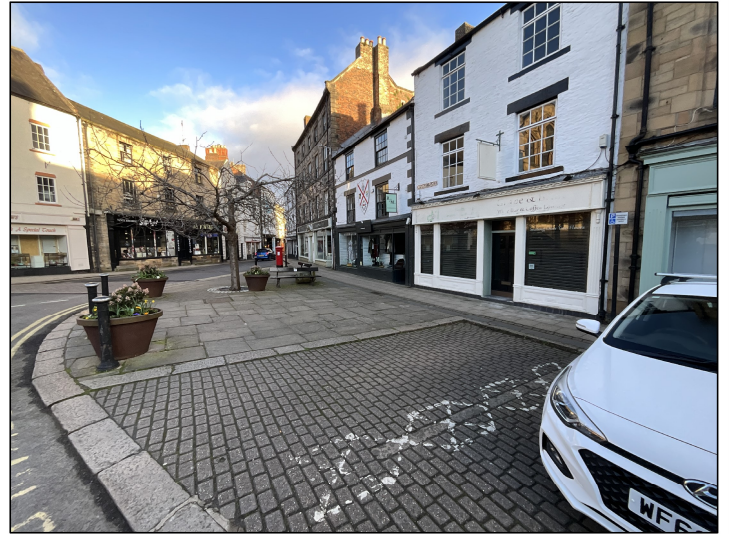
GENERAL VIEW OF AREA