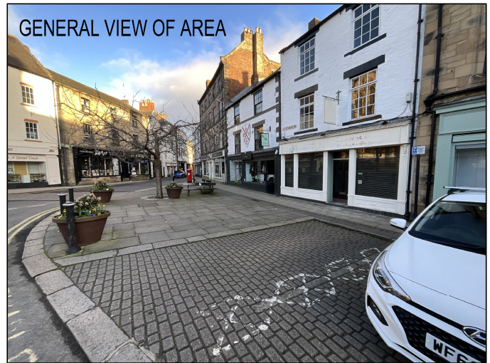
QUATTRO SQUARE PARASOL